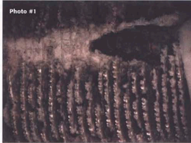
Untreated Coil after 4,000 Hours Exposure in Salt Spray / UV Chamber

Apply Coil Shield now and secure your equipment investment against early failure.